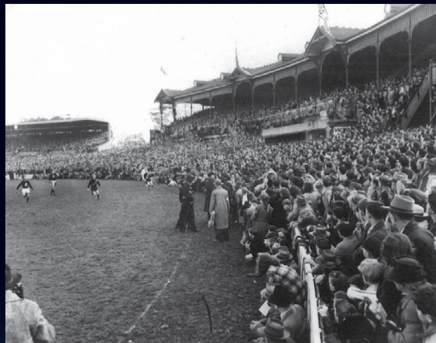
(above) A record crowd at Punt Road Oval against Carlton in 1949 (below) Unfurling the 1932 premierships flag

The Richmond Football Club invites you to help ensure 'Tigerland' remains a strong and proud home for our children, grandchildren and all the generations to come, by generously extending your lifetime of support for the Club.